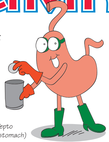
Pepto (the stomach)

Pepto's parents said he could donate any change he found in the living room. Count up all the change he found.