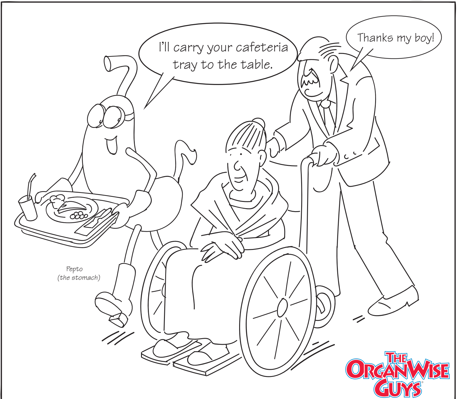
Pepto (the stomach)